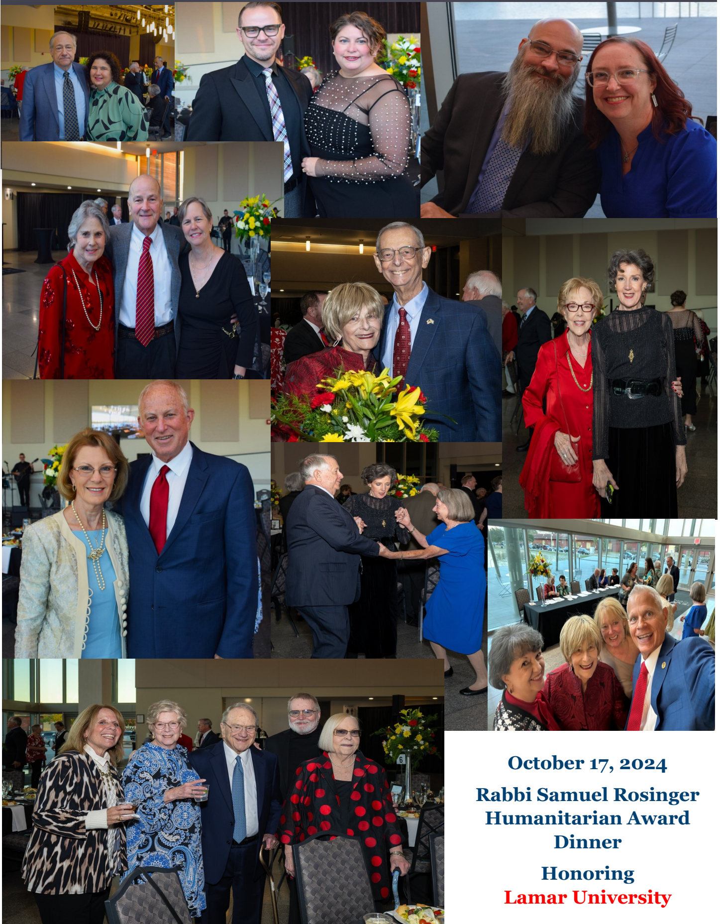
October 17, 2024 Rabbi Samuel Rosinger Humanitarian Award Dinner Honoring Lamar University